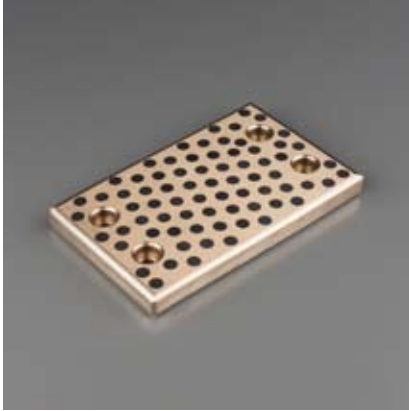
Material: Bronze with Graphite