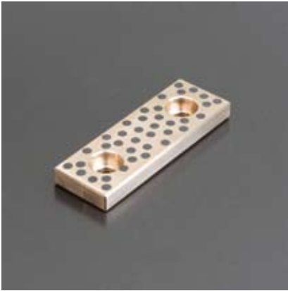
Material: Bronze with Graphite