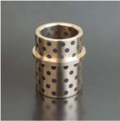
Material: Bronze with Graphite