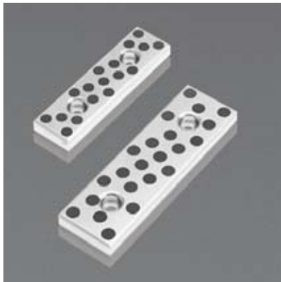
Material: Bronze with Graphite